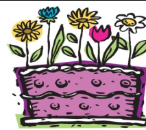
Birthdays this month!