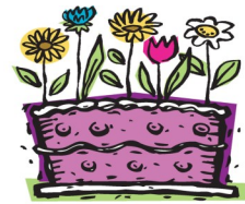
Birthdays this month!